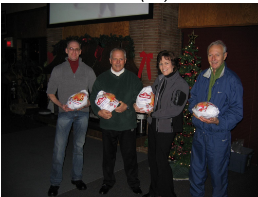
Turkey winners at TGIF