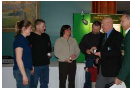
Team Briand receiving their silver medals

Glenmore is very proud of your performance and congratulate you all on a fantastic week!