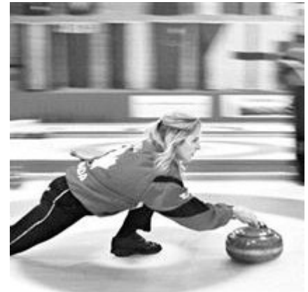
Team Canada skip Jennifer Jones during a practice last year.

Action: Lift your right hand off the floor and place your bent elbow inside the right foot. Hold for two seconds. Put your right hand back outside the right foot and bring your back leg forward until both feet are together. Place both hands on your knees and stand up. Repeat, stepping forward with your left foot and placing your left elbow inside the left leg. Repeat two or three times on each leg.